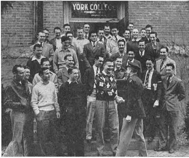
Veterans at York College Greet a Returning Veteran