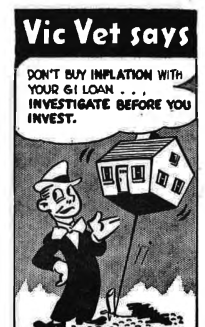
For correct Information contact your mearest Veterans Administration office.

Ice-cream and heart-shaped cookies, and coffee were served.